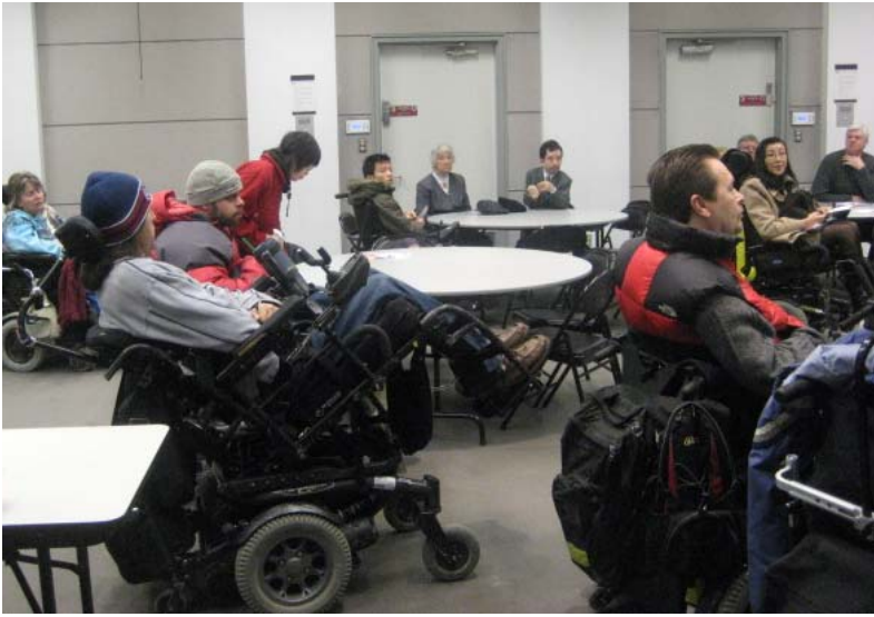
Audience: ConneCTra members listening to presentations at the group's Dec. 15 workshop.