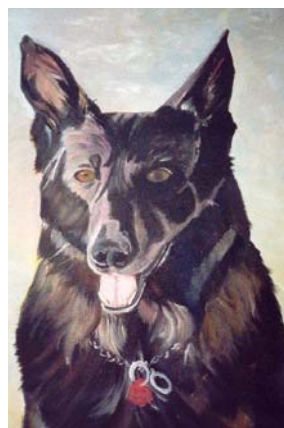
Art display: Hilda's dog , painted by Cody Tresierra.

When people in BC on income assistance open an RDSP with $25, they can apply for a $150 grant from the province's Endowment 150 fund.