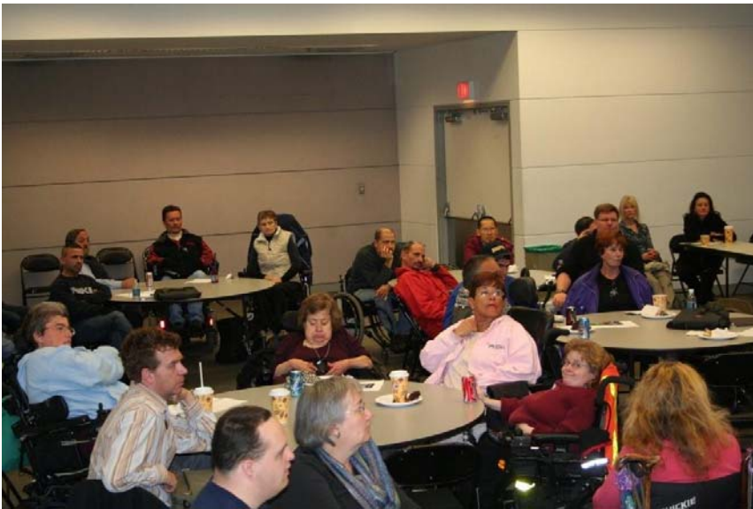
Packed audience: ConneCTra members at the Oct. 22 workshop.